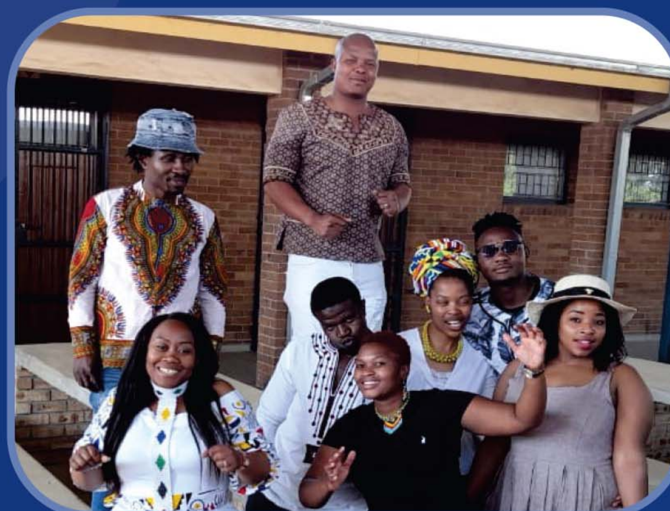
Mphohadi Campus Staff Members

It is important that we celebrate this day as it allows us to honor the culture and diversity of beliefs and traditions of all South Africans.