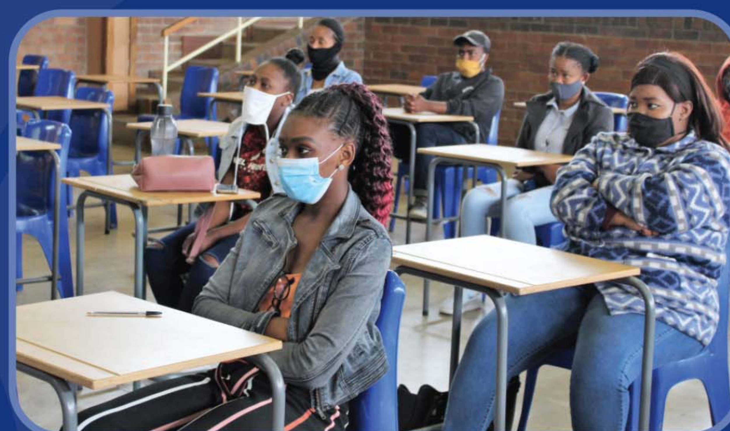
Students listening attentively during the Induction.

ASD Projects and Business Unit liaising with a student during the FP&M SETA induction.