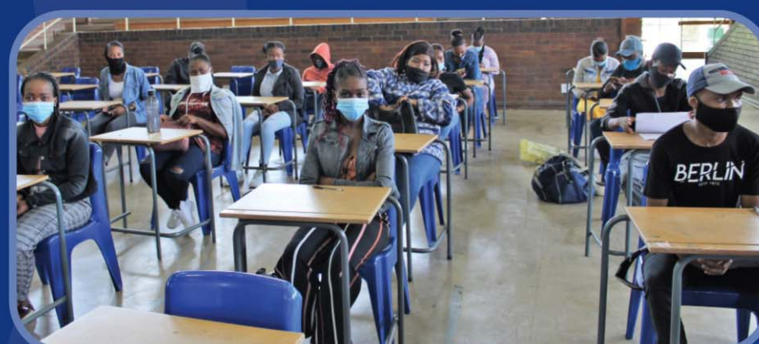
Students listening attentively during the Induction.