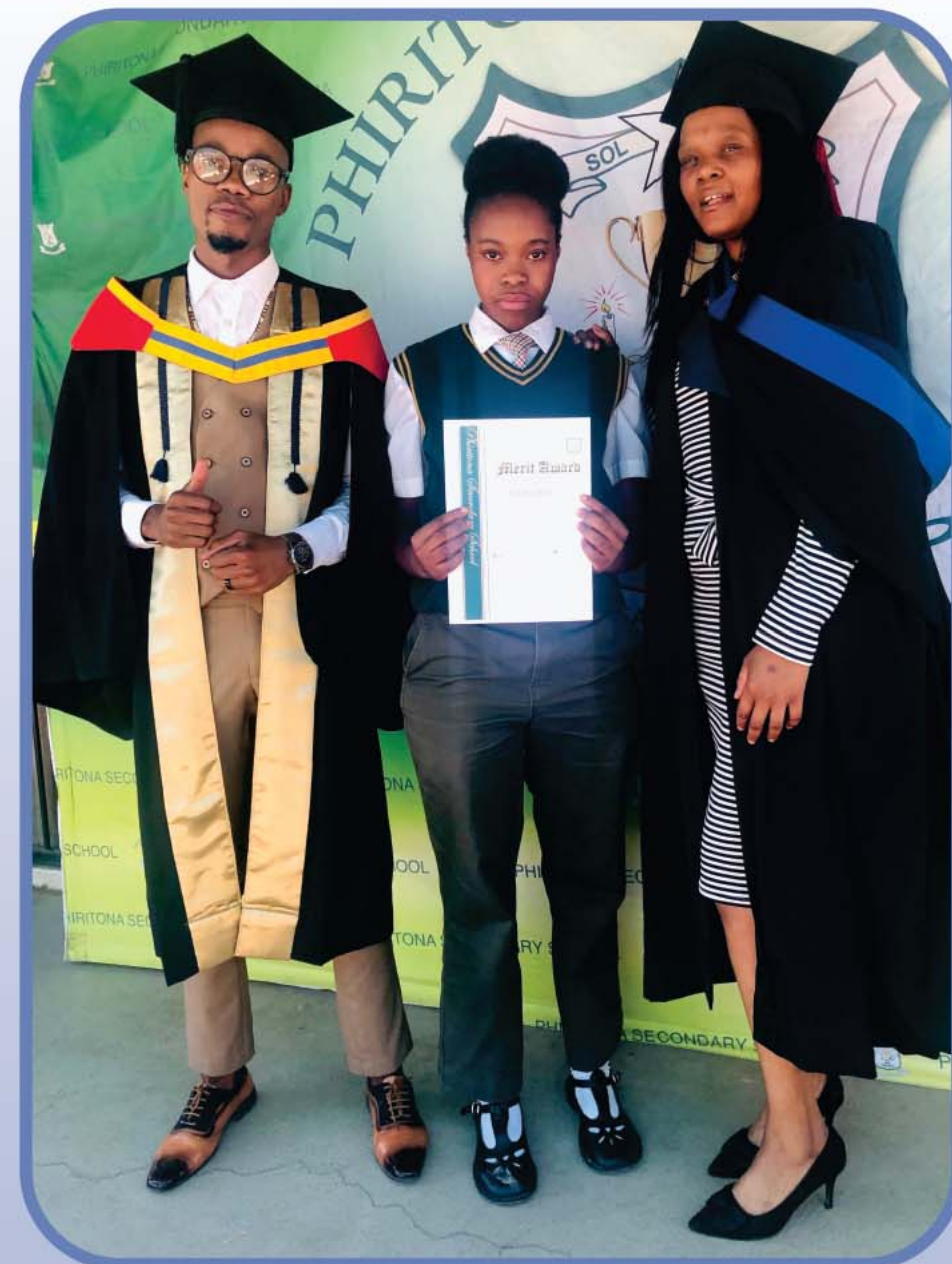
Teachers & a student at Phiritona Secondary School

Awards were given to the top achievers, awards were categorised as follows: best improved behaviour, best improved academics, leadership quality, neatness, best learner in a subject, best learners in a